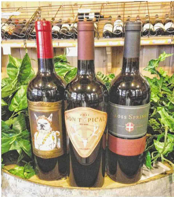
The California wine world has expanded.